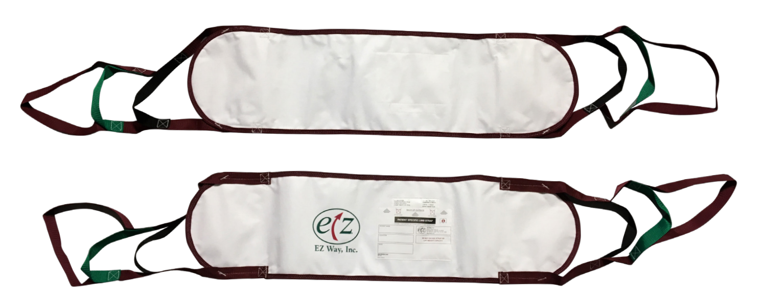
SPLS300 - Single Patient Limb Lifting Strap