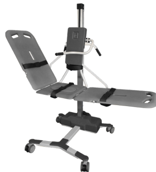
EZ 0542030 - Bath Lift System for chair w/ Stretcher Wings