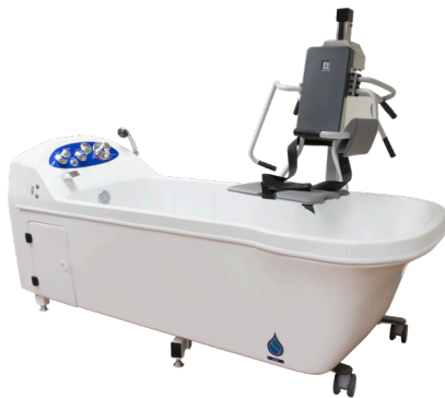
Works great with the EZ Mobile Bath Lift System

The Rane Bathing and Accessibility product line provides a unique combination of style, ease of use, comfort and low cost of ownership.