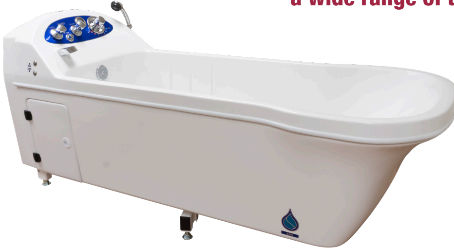
RS8FD - Geneva Supine Bathing System

The key-hole shape enhances patient comfort with extra room for the shoulders and arms, plus allows the caregiver closer and greater access to bathe the resident. The height adjustable model is raised or lowered at the touch of a button and allows the caregiver to work at the proper height, thus eliminating back strain. The optional Auto-fill eliminates waiting and/or observation time when pre-filling the bathtub to a pre-set level.