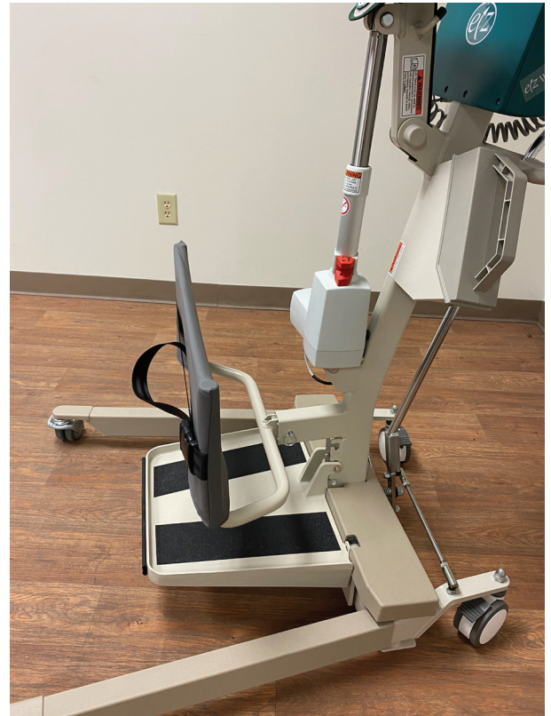
Item Number 11202 Flexible Fabric Shin Pad

"Your Total Safe Patient Handling Solution"