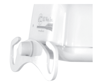
Figure 4 - Hanger Bar