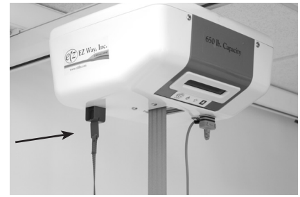
Figure 5 - Emergency Stop