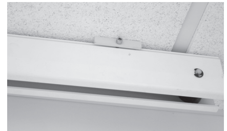
Figure 3 - Mounting Bracket