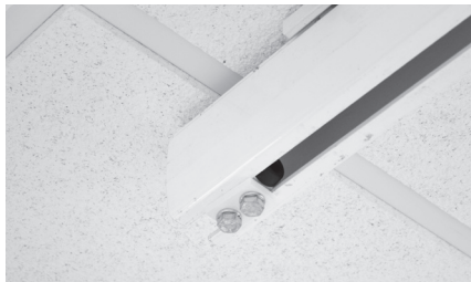
Figure 1 - End Stop