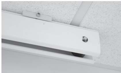
Figure 2 - End Stop 2