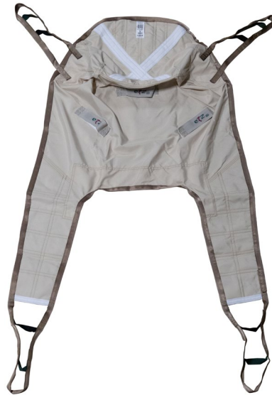
Deluxe Sling with Head Support in Washable Polyester