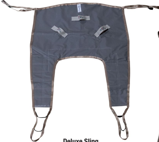
Deluxe Sling in Wipeable material

Rated to 1,000 lbs., double-box stitched for added safety and durability, 4-loop connection design, and color-coded for sizing*. Available in Washable, Wipeable, Mesh, Spacer Mesh, or Antimicrobial materials along with several options including head support, belted, and fleece lined.