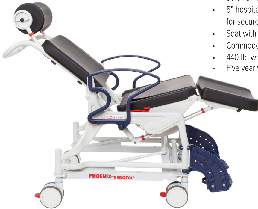
440 lb. Weight Capacity