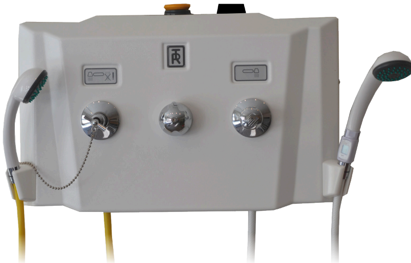
2810 - Shower Panel