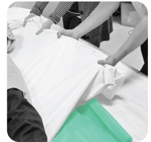
Slide Mate Sheets