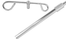
Height Adjustable IV Pole