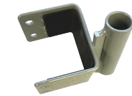
Oxygen Tank/IV Pole Bracket