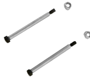
5/16" x 3/4" bolts and 1/4" x 20 lock nuts