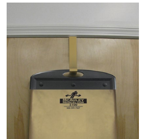
8" MRI Safe Door Mount Hanger Part # 2087