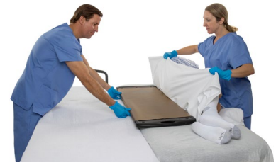
Gold EMS 50" x 15" Part # 5900