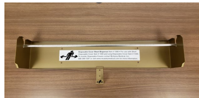
Rollboard Disposable Cover Dispenser, Part # 1088