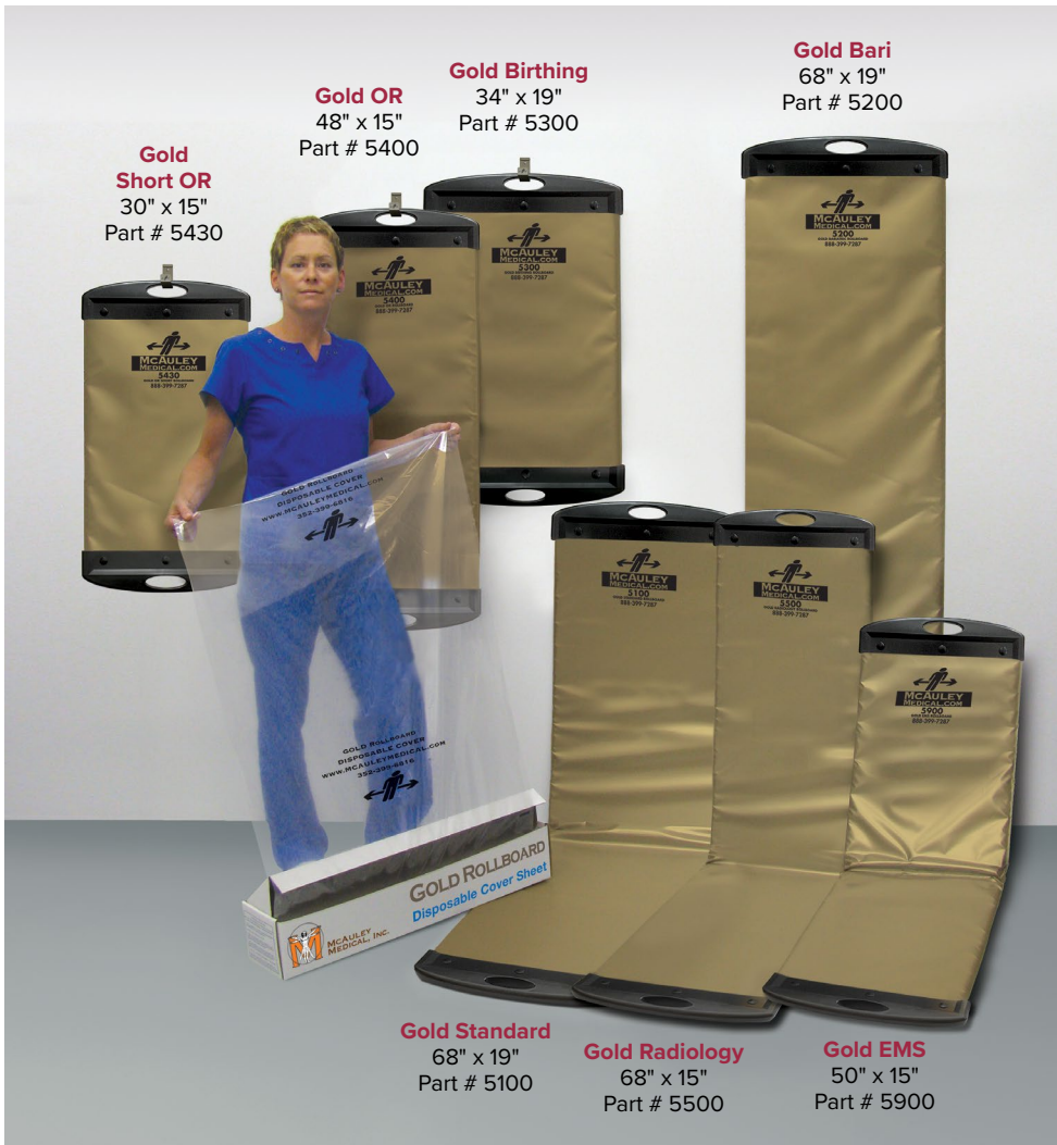
Gold Short OR 30" x 15" Part # 5430