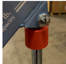
TOP OF ACTUATOR