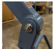
BOOM TO MAST