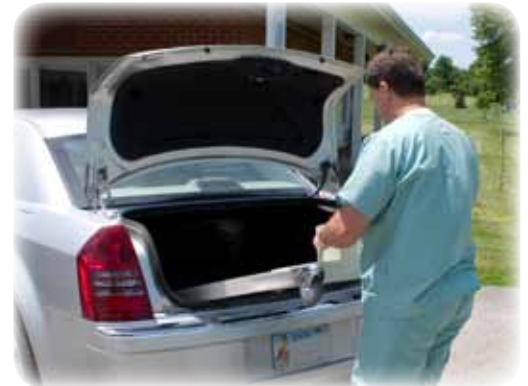
Easily fits in a standard vehicle trunk.