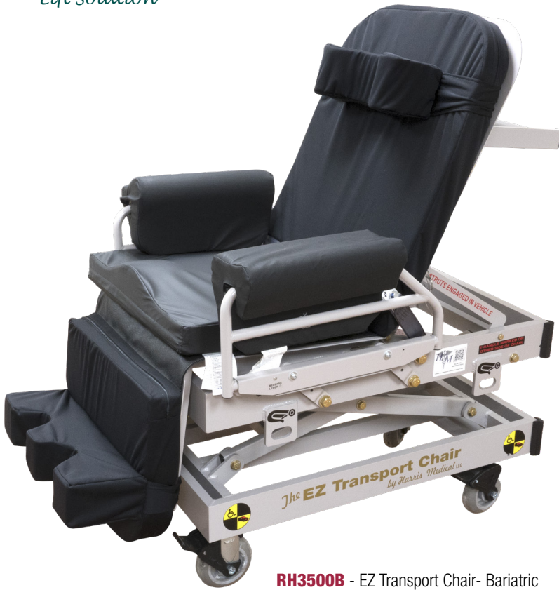
RH3500B - EZ Transport Chair- Bariatric

A unique multi-purpose stretcher, exam table, and transport chair reducing patient transfers and transport costs.