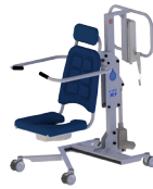
RL9 Bath Lift