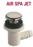
AIR SPA JET