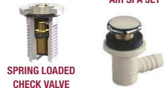
SPRING LOADED CHECK VALVE

Tranquility – Rubber mounts are designed to absorb 95% of the motor vibration.