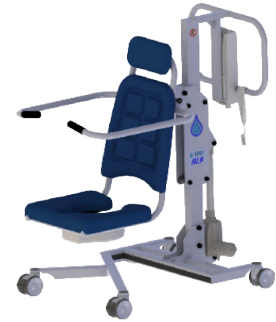
RL9 Bath Lift

The RG9 Victoria is a freestanding tub that allows the caregiver 360° unobstructed access to the resident.